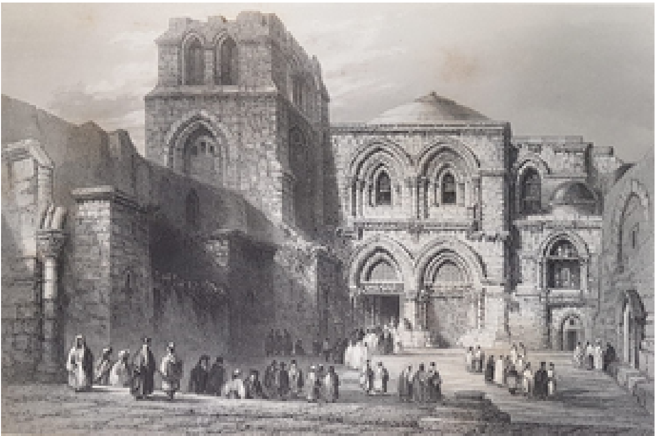
Church of the Holy Sepulchre

An obvious question for Bartlett to examine was the site of Golgotha (Calvary). As is well known, the problem was that the location and outline of the Second Wall in the time of Jesus could not (and cannot) be precisely determined, because the area is built-up and cannot be excavated. If the Church of the Holy Sepulchre is within that wall, it cannot have been the site of a tomb, since burials had to be located outside the city walls. Although we still do not know exactly where the Second Wall stood in that area, recent excavations beneath the adjacent Lutheran “Erlöserkirche” (“Church of the Redeemer”), which was inaugurated in 1898 in the presence of Kaiser Wilhelm II, have exposed findings from that period, thereby giving significant historical support to the tradition that the Church of the Holy Sepulchre is located outside the Second Wall and does, indeed, mark the spot of Golgotha.