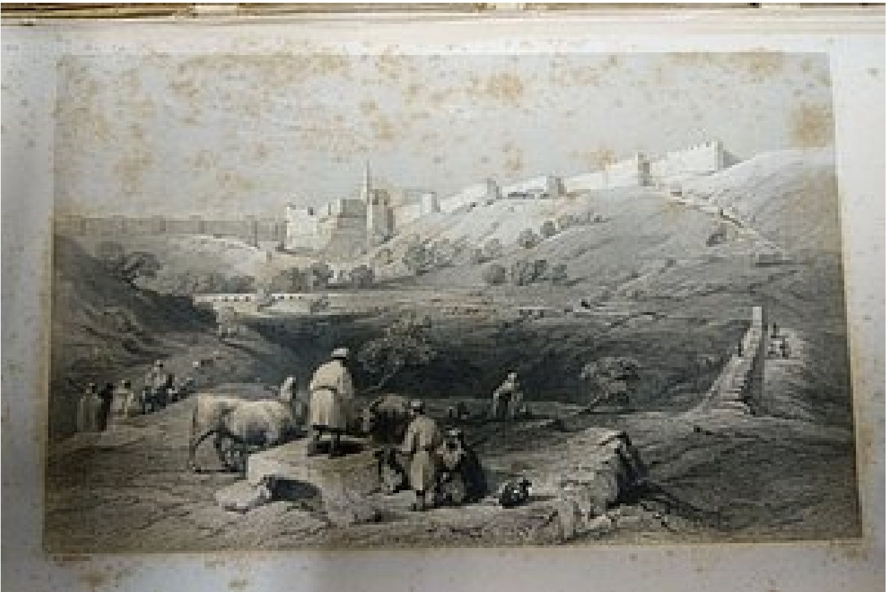
Jerusalem from the West with David's Citadel Front: Dam of Sultan's Pool in Valley of Hinom (Gehinom; Gehenna) (On the far right is the hill called "Mount Zion" by early Christian pilgrims)