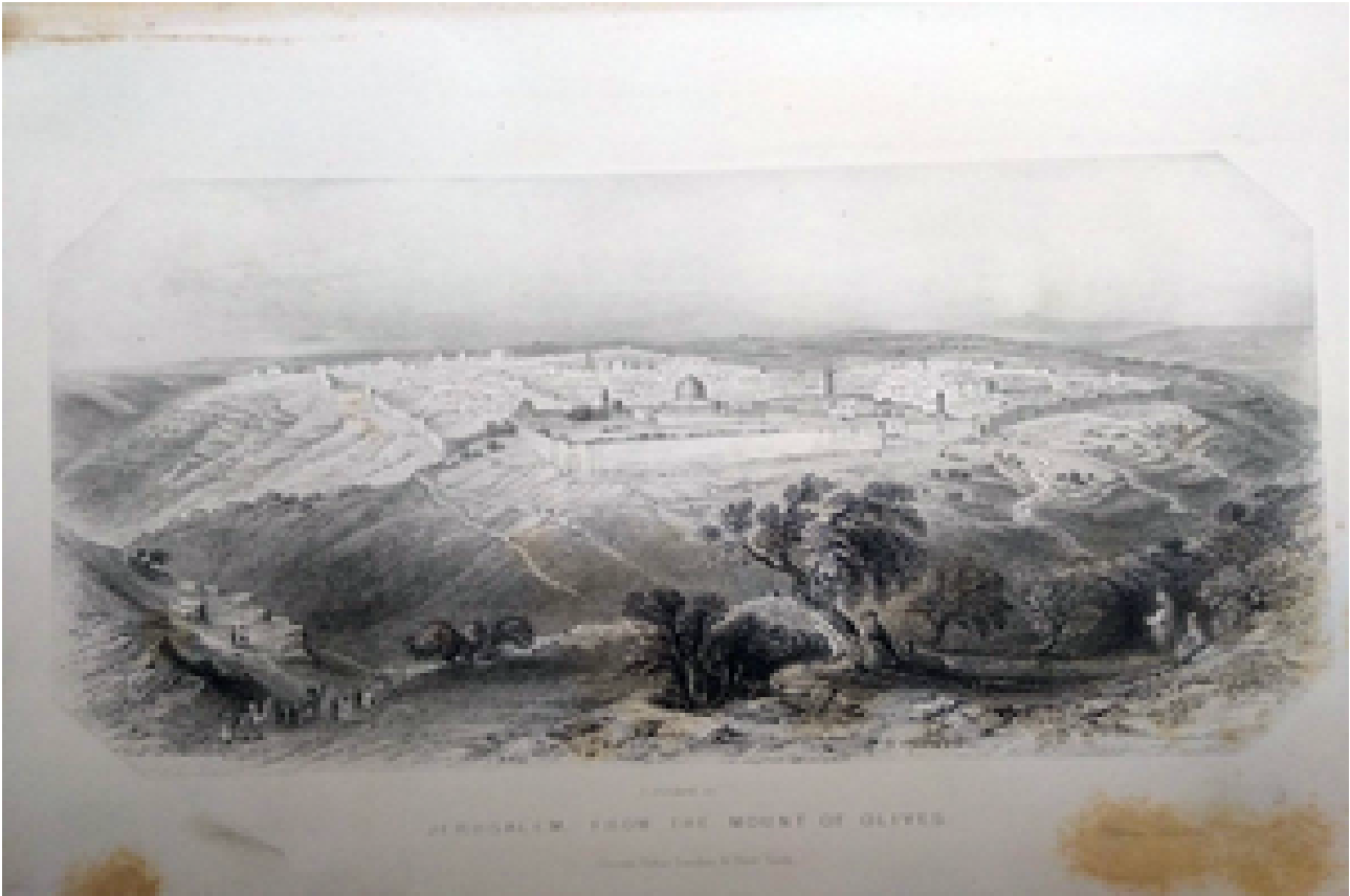
Jerusalem from the east – from the Mount of Olives