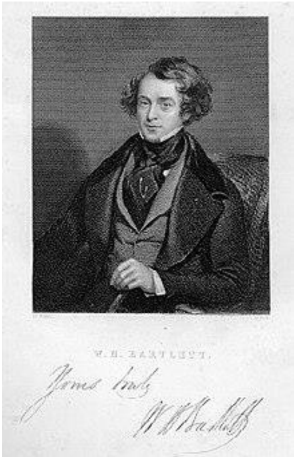
Self-Portrait of William Henry Bartlett

The British artist William Henry Bartlett was born in London in 1809, and became famous for his many drawings of his travels throughout Britain, the Balkans, North America, and the Middle East. His sepia wash drawings of sites he visited were made in the exact size of the steel engravings made from those drawings and published in his books.