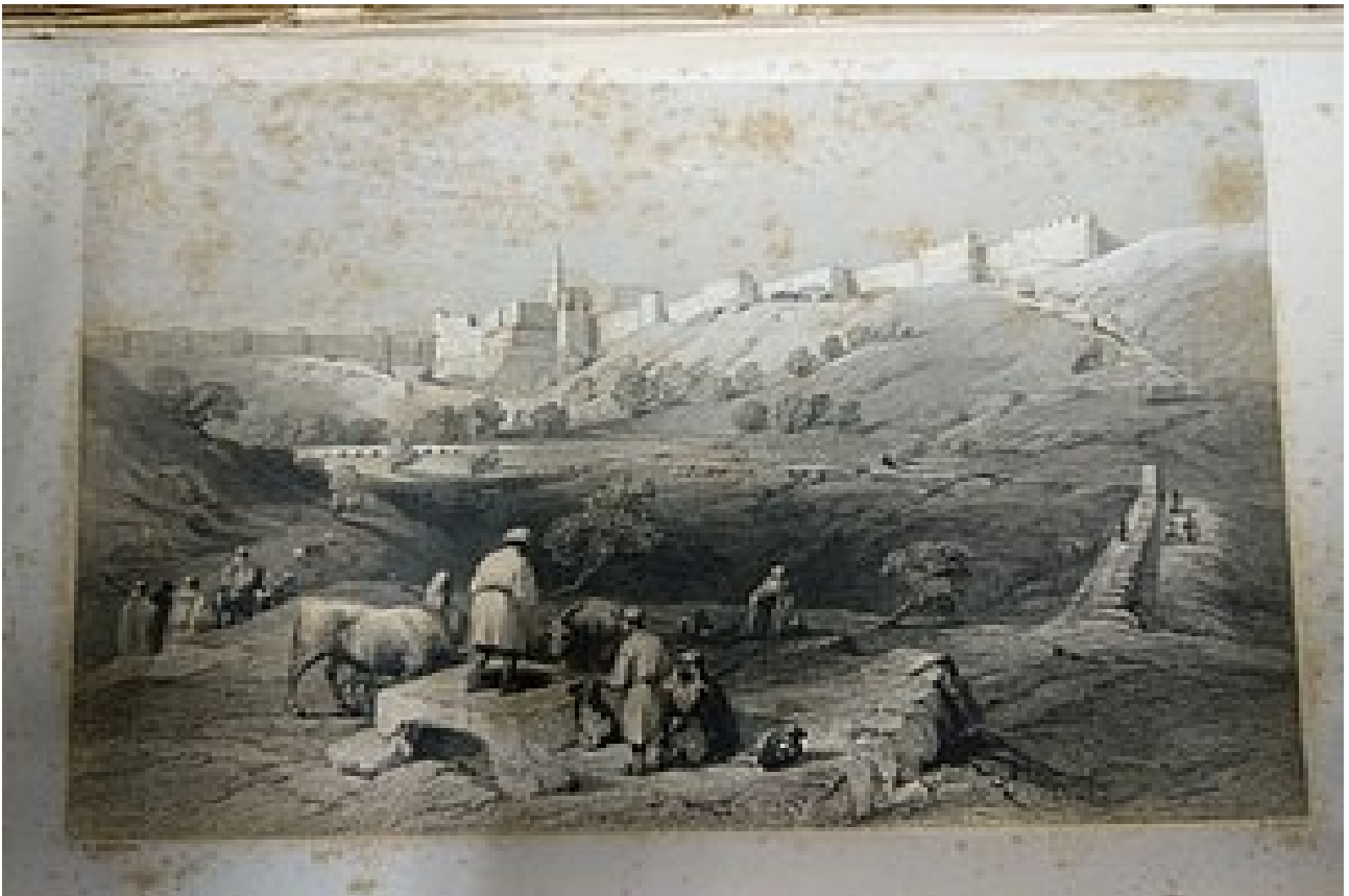
Jerusalem from the West with David's Citadel Front: Dam of Sultan's Pool in Valley of Hinom (Gehinom; Gehenna) (On the far right is the hill called "Mount Zion" by early Christian pilgrims)