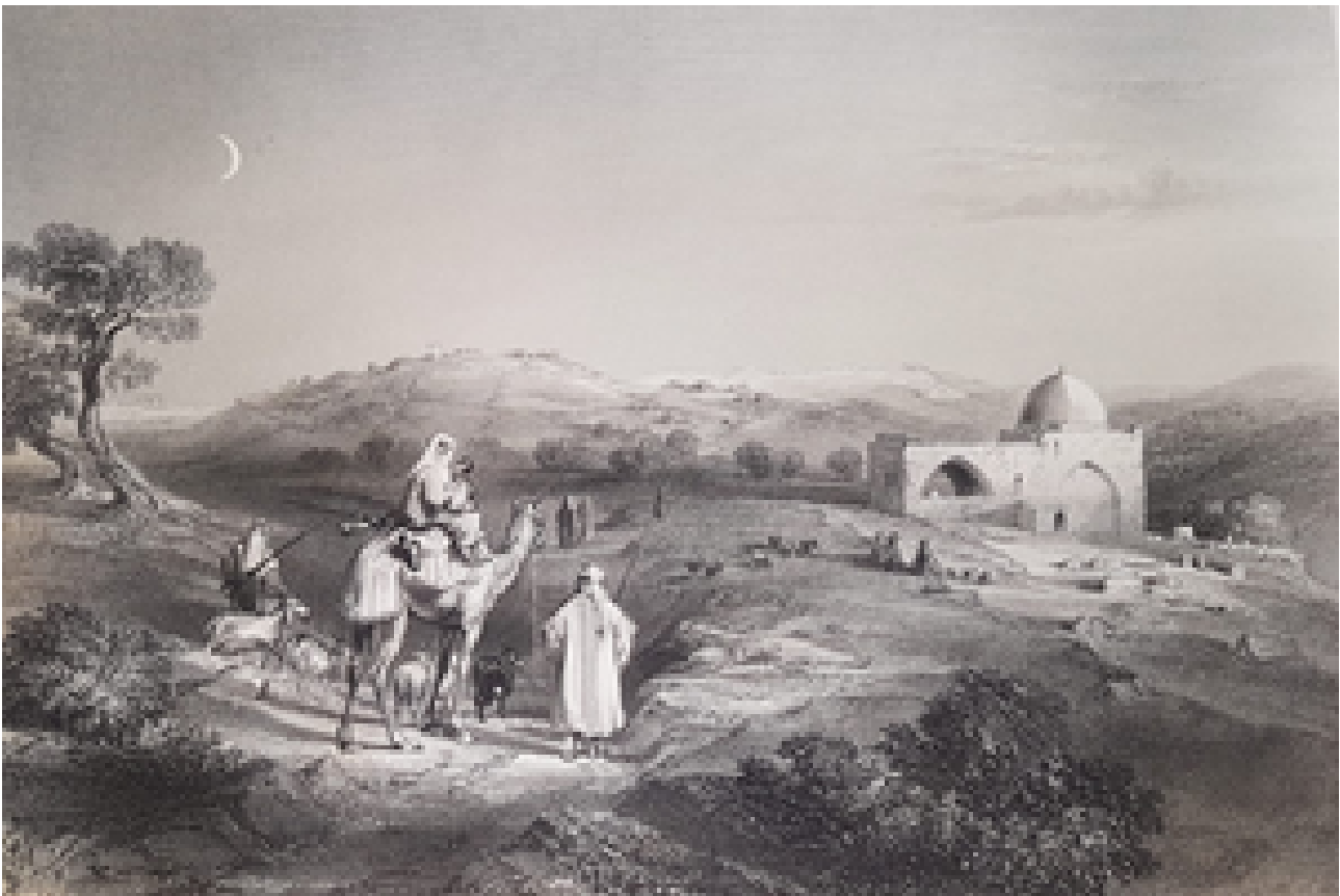
Tomb of Rachel