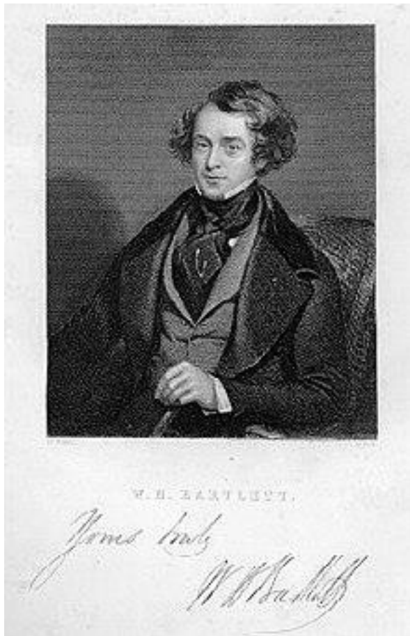
Self-Portrait of William Henry Bartlett

The British artist William Henry Bartlett was born in London in 1809, and became famous for his many drawings of his travels throughout Britain, the Balkans, North America, and the Middle East. His sepia wash drawings of sites he visited were made in the exact size of the steel engravings made from those drawings and published in his books.