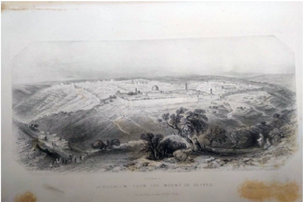
Jerusalem from the east – from the Mount of Olives

The fact that many of Bartlett's conclusions and speculations – like those of Robinson – have since been revised and/or disproven by subsequent archeological research in Jerusalem (especially since the reunification of the city in 1967) in no way detracts from the magnificence of his intellectual efforts to understand the history, topography and geography of the city, and from the beauty of his illustrations, which have historical as well as artistic value. As the saying goes, a dwarf standing on the shoulders of a giant will see farther than the giant, and the conclusions and speculations of today's research are also likely be revised and/or disproven by future research. [4]